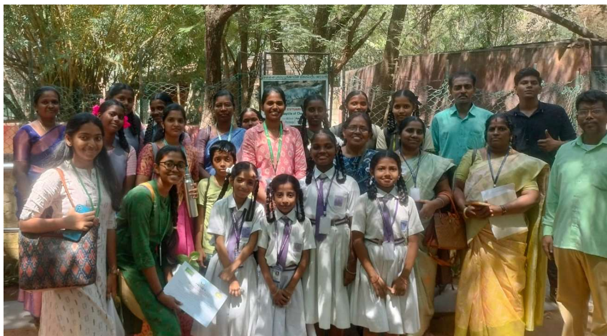
(A Group photo during the park visit by the participants with the Biologist )