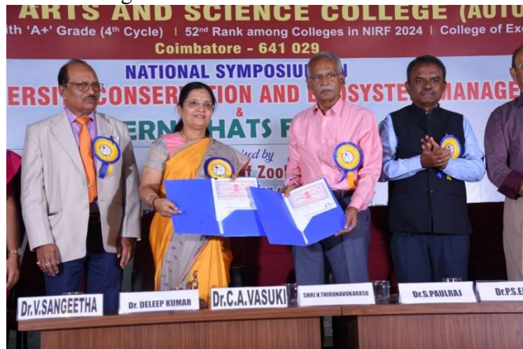
( MOU signing between CSPT and KASC.)

The Executive Chairman, CSPT and the Secretary of the College, the MoU has entered between the Chennai Snake Park Trust and Kongunadu Arts and Science College, Coimbatore on 06.03.2025. The main aim of the MoU is in the field on collaborative research engaging college students in internship programme and project work to full fill their degree course.