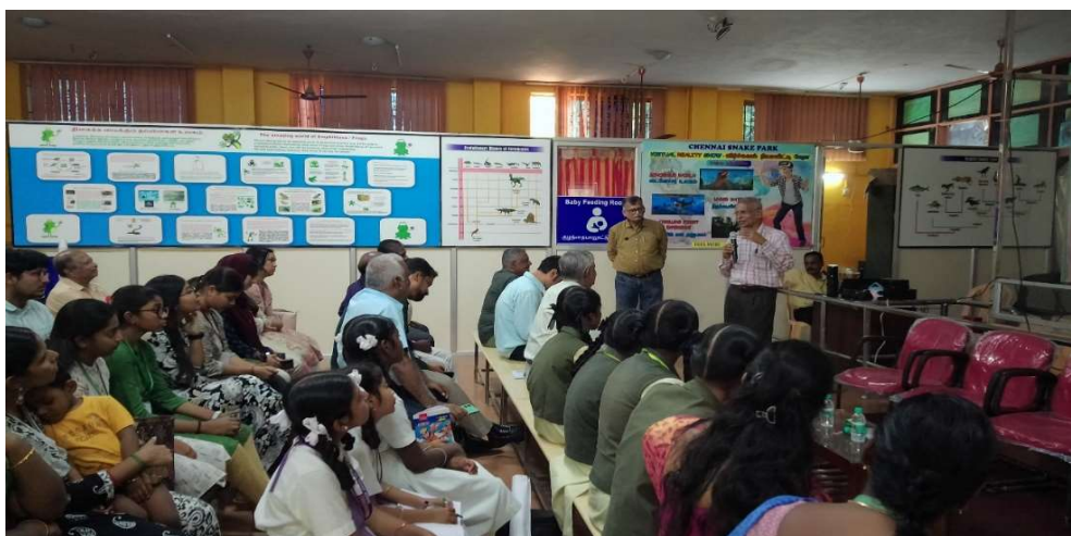
(Chairman interacting with the audience )