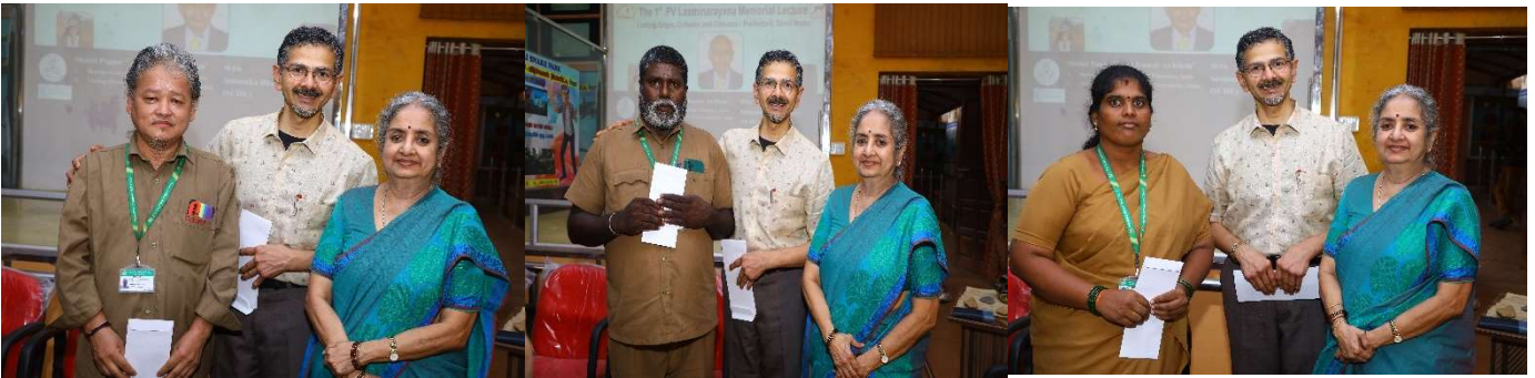
( CSPT Employees receiving the Cash awards )