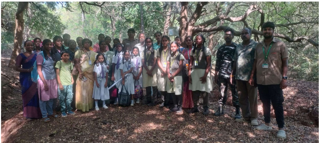
( Nature walk into the wild area of Guindy National Park guided by the Forest officials .)