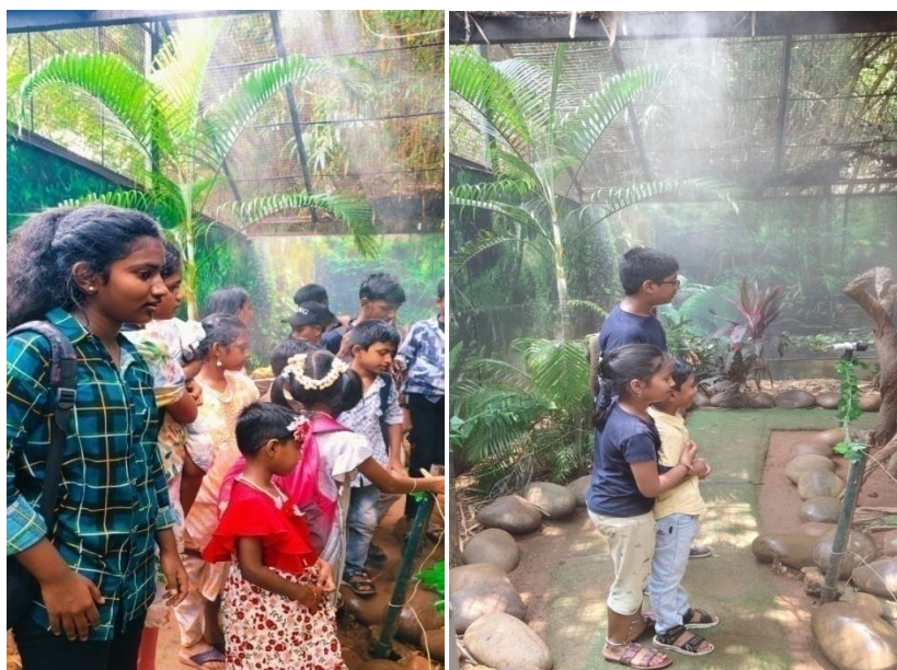
(Mist sprayer fitted to maintain the ambient temperature to escape from the scorching summer heat.)

During the month April 2025, several precautionary arrangements were made to beat the summer heat. Misting chambers were created in yellow anaconda enclosure, Dog faced snake enclosure and walk through Iguana Enclosures. Water sprayed in all enclosure to reduce the heat. In albino python enclosure and chameleon enclosure, jute bags are spread above the enclosure and water sprayed at regular intervals. Enclosure ambient temperatures were regularly monitored.