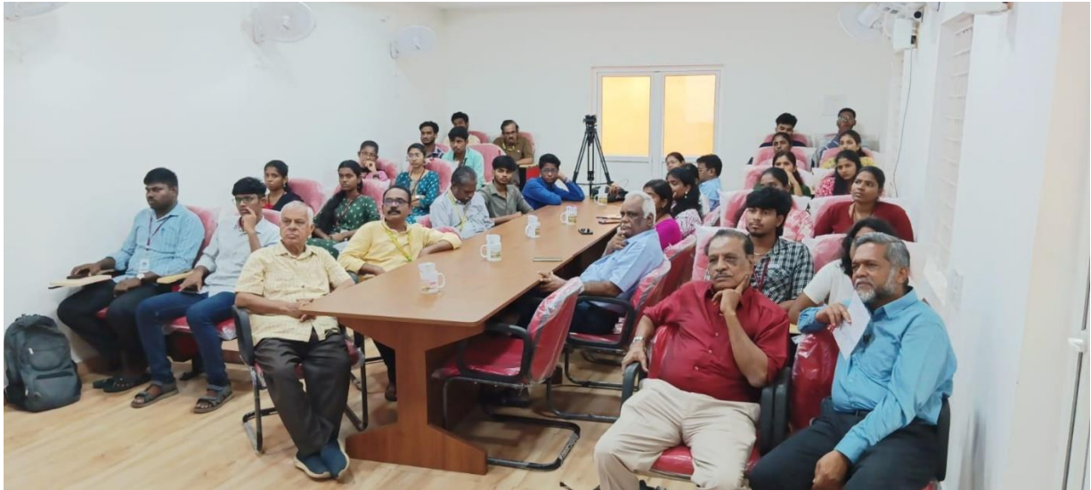
(Participants witnessing the programme of World Snake Day conducted at Chennai Snake Park Trust.)