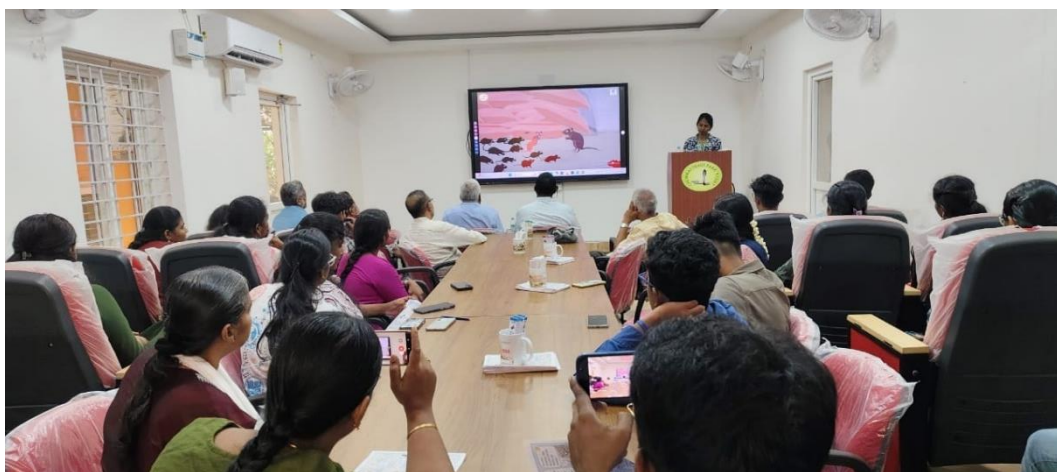
(Release of Snake awareness Cartoon film "Snakes are Farmer's Friends" by the Chief guests.)