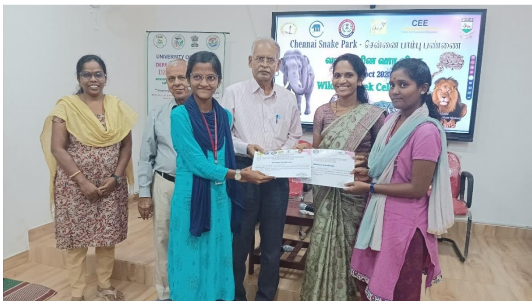
(Photo: Wildlife Week celebration- Quiz programme winners receiving the certificate and cash prize from Chief Guest and Executive Chairman of Chennai Snake Park.)