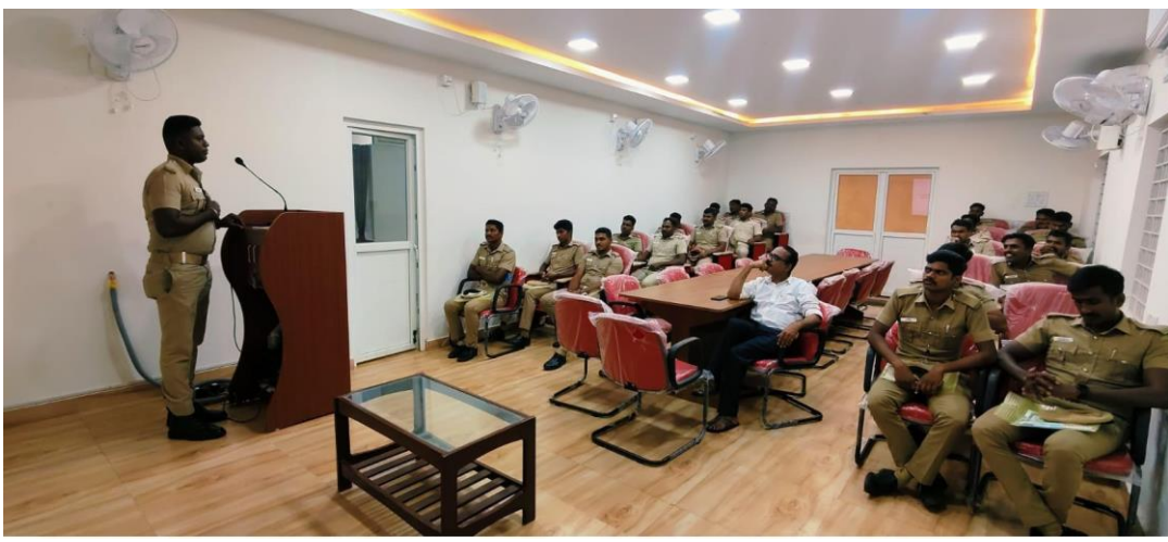
(Feedback session given by one of the Fire and Rescue Service Trainee.)