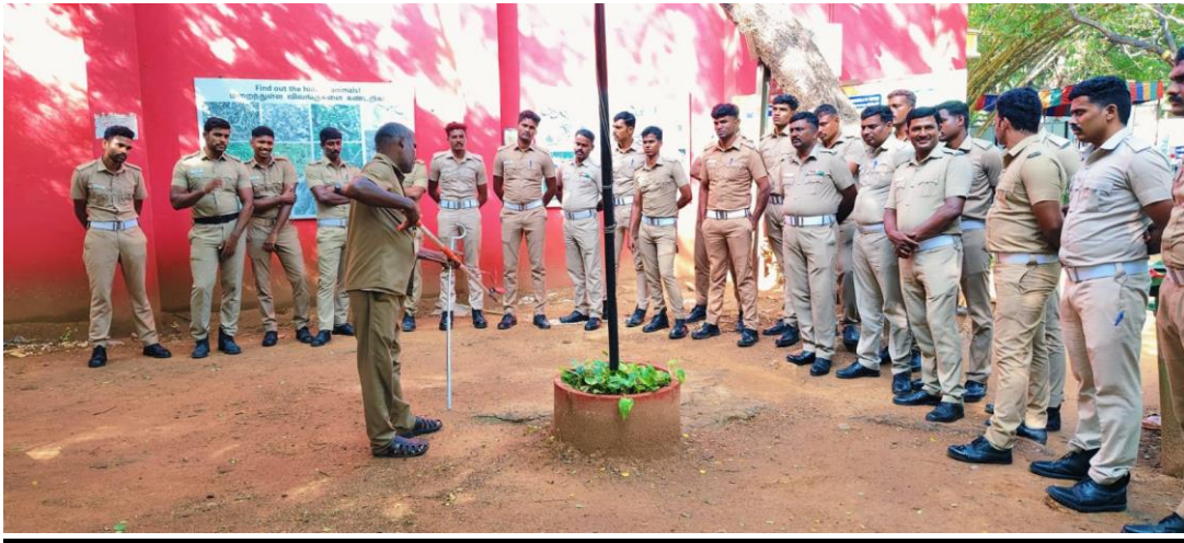
(Snake Handling- session demonstrated by animal keepers at CSPT for the trainees.)