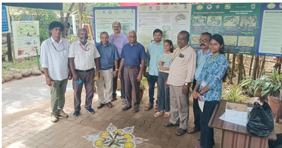
(Photo: Wildlife Week Inaugural function at Chennai Snake Park in collaboration with ZSI southern Region.)