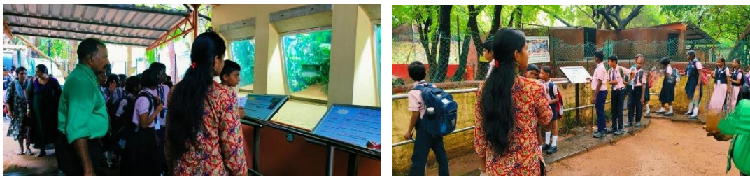
(Students of Guardian International school visiting the Snake and Crocodile enclosures.)