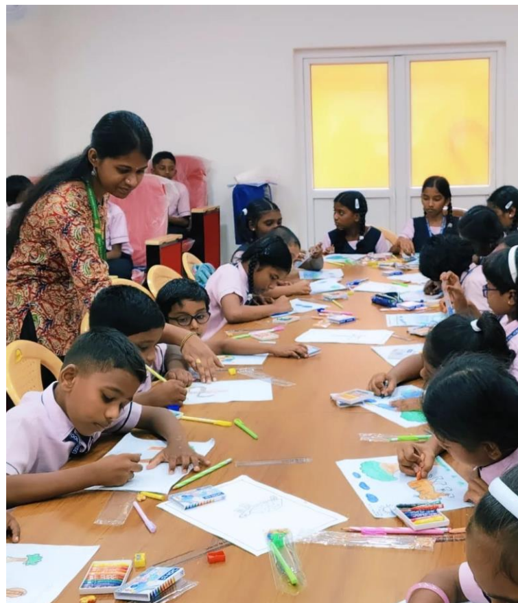
( Wildlife week 2025: Drawing competition for the School students )