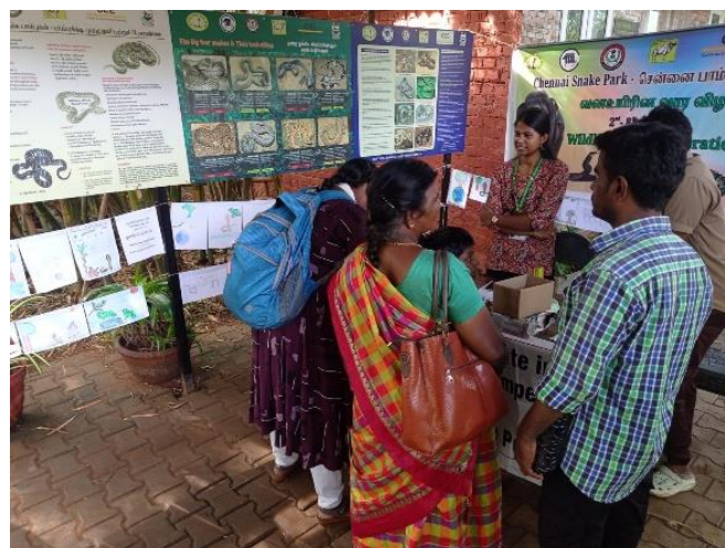
(Photo: Wildlife week 2025-On Spot Quiz Programme for general public.)