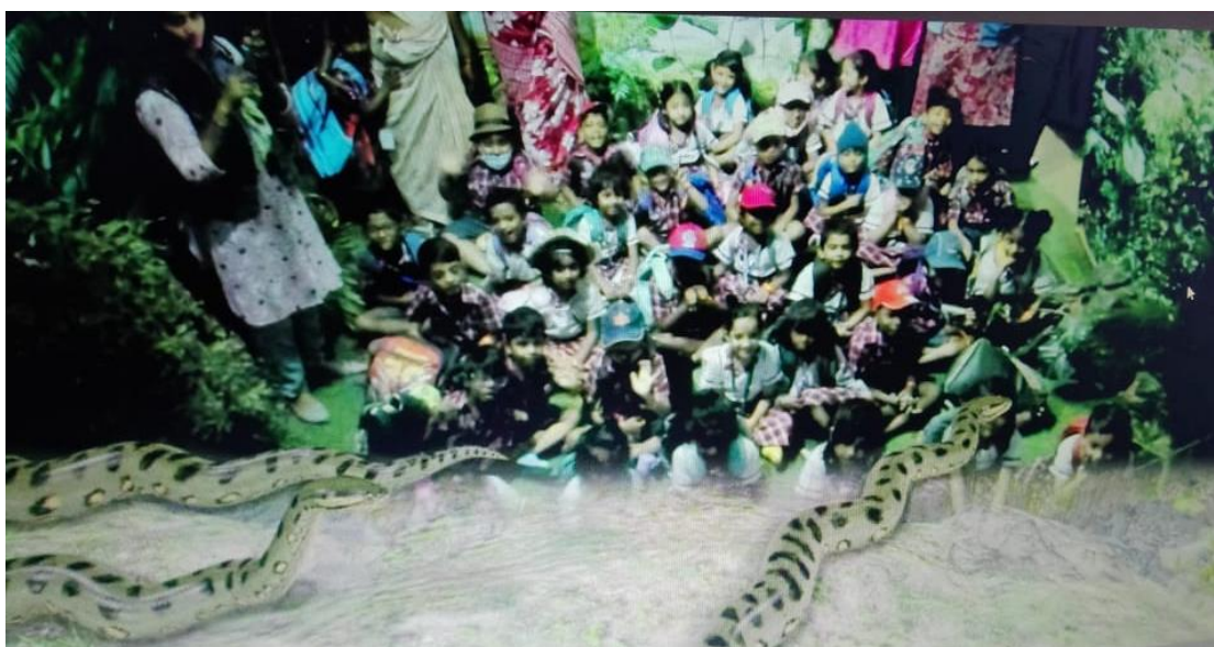
(Chaitanya School students enjoying the AR Show at Chennai Snake Park.)

On Dec 8 th , students of Chaitanya school from various Chennai branches visited Chennai Snake Park and enjoyed the AR Show. Around 400 students visited the park.