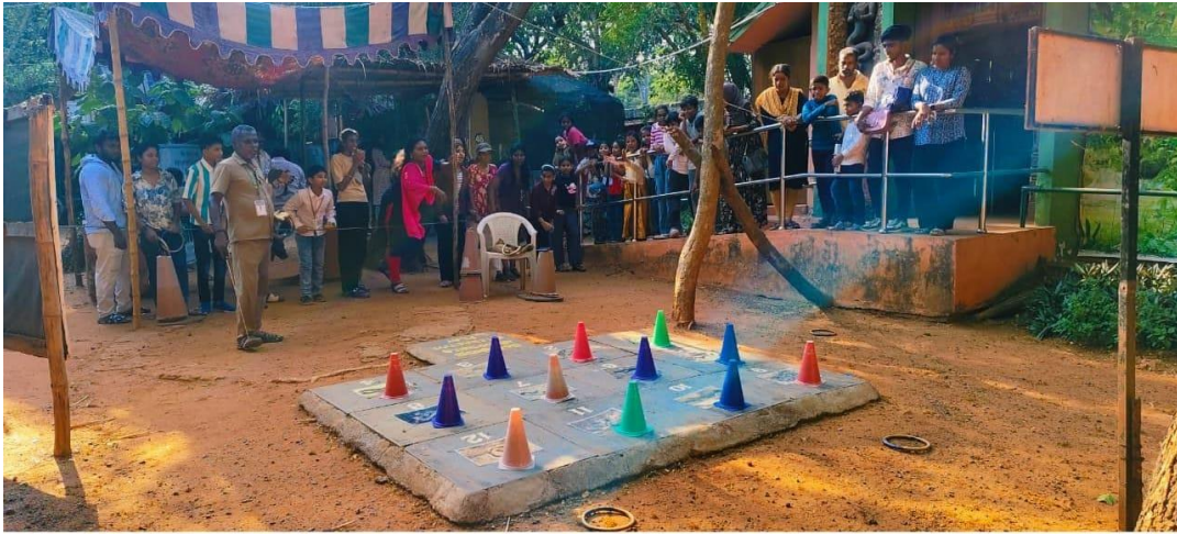
(Ring throw as part of Educational game)