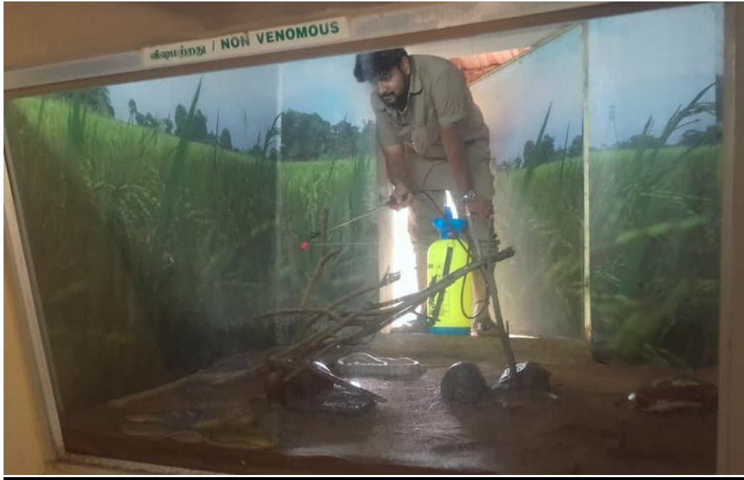
(Summer Arrangement- Water spraying inside the animal enclosure)