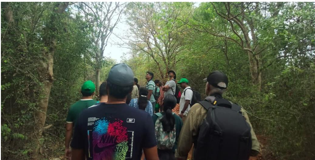
(Nature Walk/ Trecking to the forest areas)