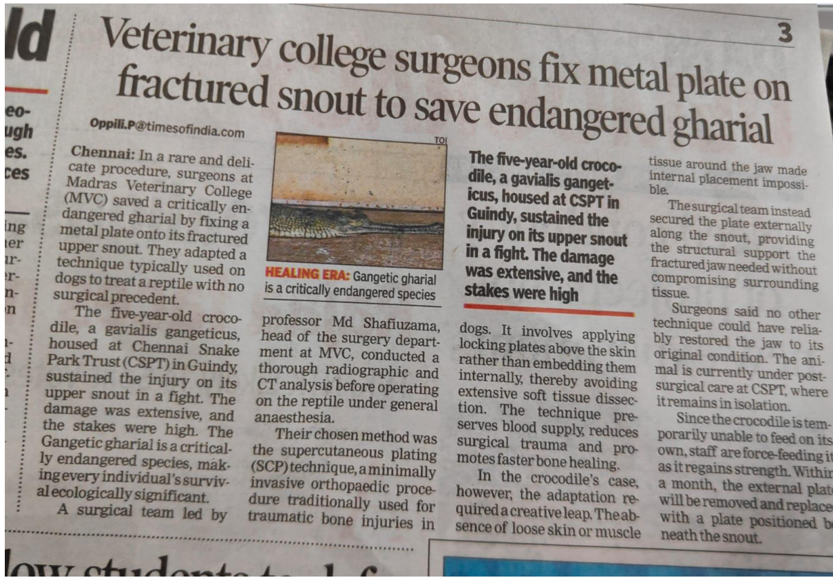
( News article released in "THE TIMES OF INDIA" about an injured Gharial- juvenile stage, dated 13 th April 2026.)