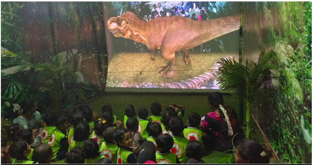
(Augmented Reality show)