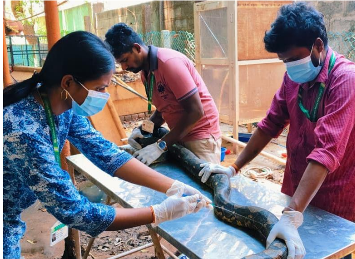
(Staffs of CSPT giving medication for an injured Reticulated python)